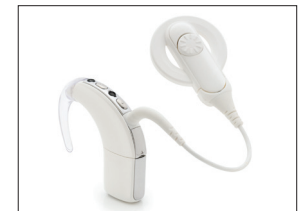
Speech processor for cochlear implant