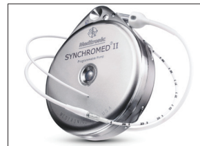
Implantable pump for chronic pain treatment