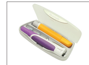
Pen injector for growth hormones