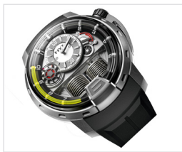
Design transfer of the microfluidic system