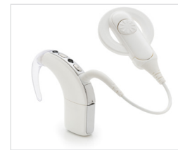
Speech processor for cochlear implant