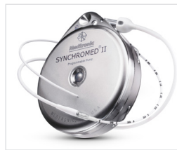
Implantable pump for chronic pain treatment